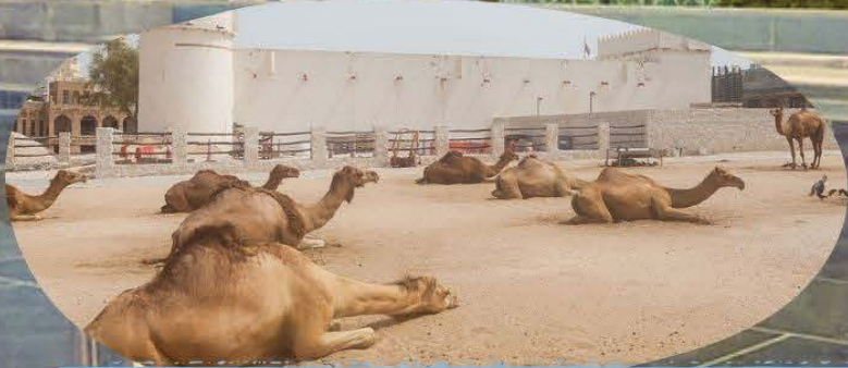
Al Koot Fort with camels