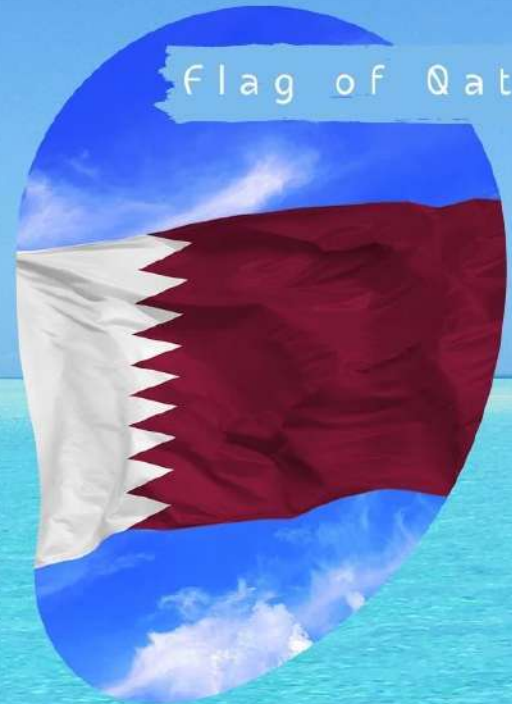
Flag of Qatar