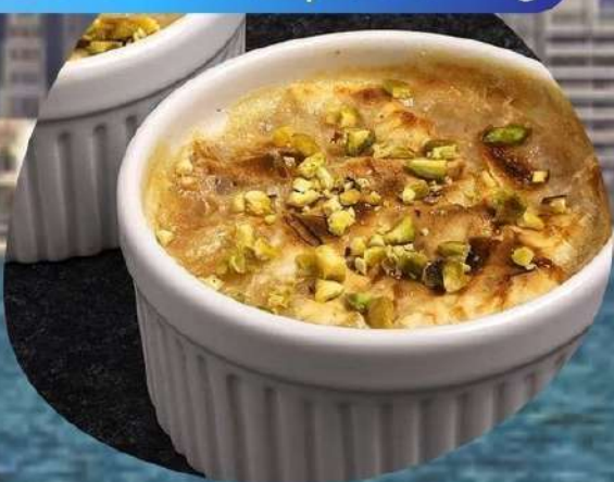
Oum Ali, pudding

Oum Ali, pudding from Qatar This recipe can be made with puff pastry, croissants. It can be garnished with different dried fruits: almonds, walnuts, coconut etc... This dessert is served hot.