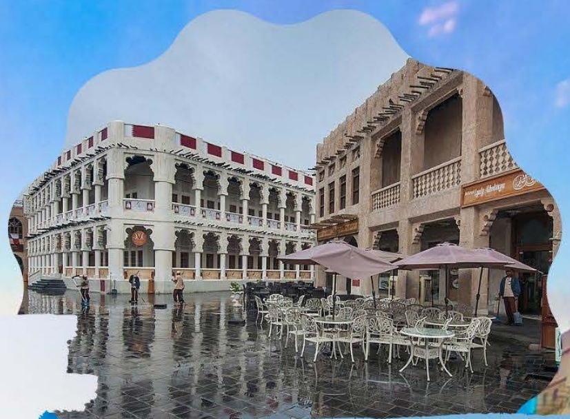
Shops in Souq Waqif