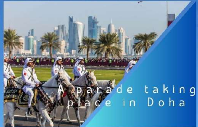
A parade taking place in Doha