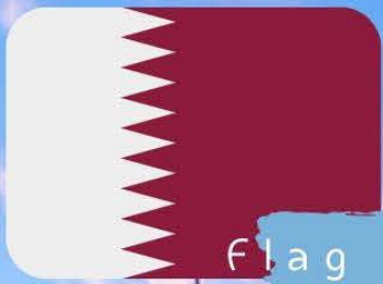
Flag of Qatar