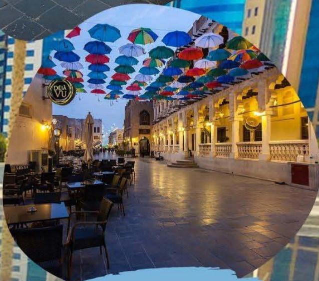
Souq Waqif, Doha with umbrellas in height