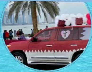
A parade next to a car