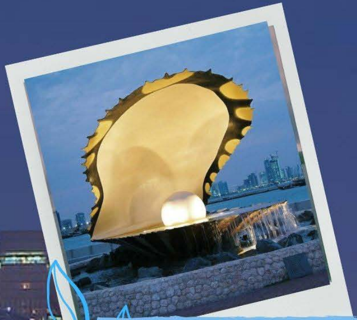
The pearl monument in Doha, Qatar