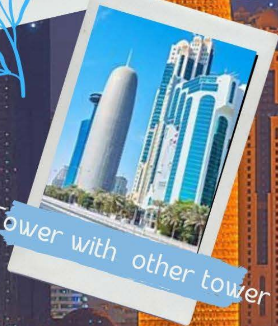
Doha Tower with other tower

Doha is the capital of Qatar. It is located on the Persian Gulf. Qatar is known for its wealth. Qatar became even richer after the World Cup .