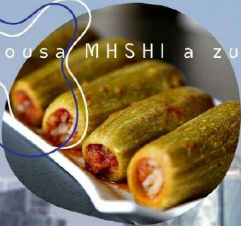
Kousa MSHI a zucchini

Kousa MSHI a zucchini with minced lamb and vegetables and flavored with parsley and mint.