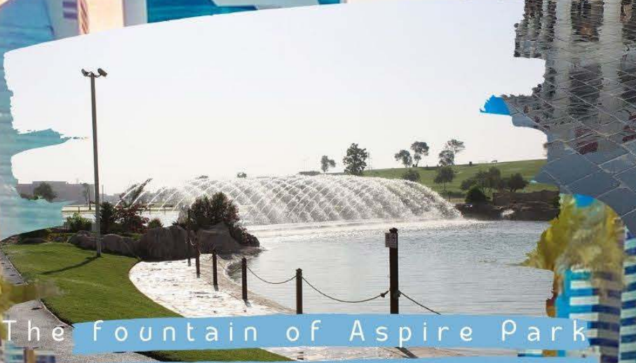
The fountain of Aspire Park